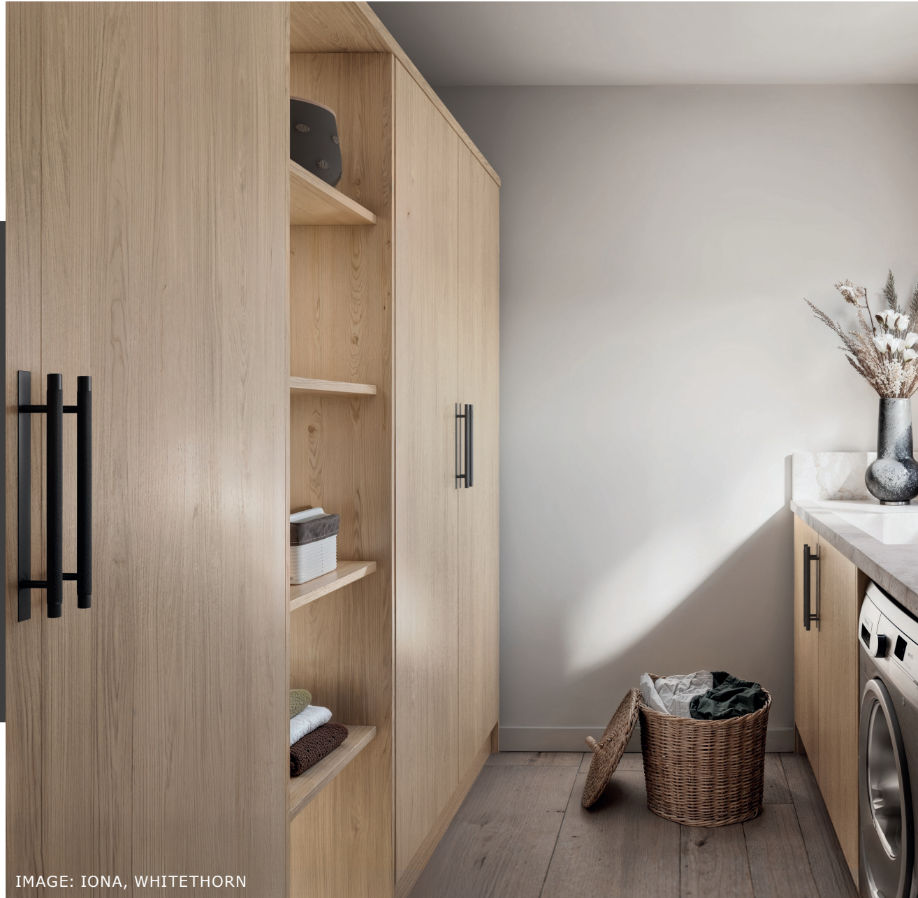
IMAGE: IONA, WHITETHORN