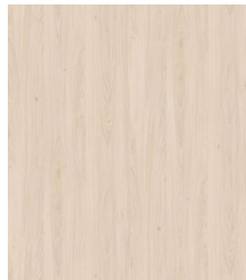
White Casella Oak