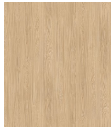
Light Natural Casella Oak