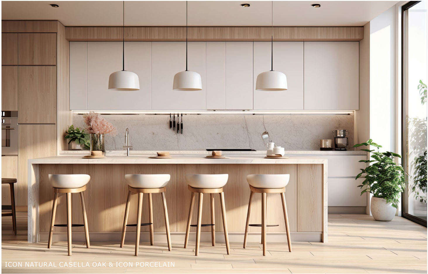
ICON NATURAL CASELLA OAK & ICON PORCELAIN