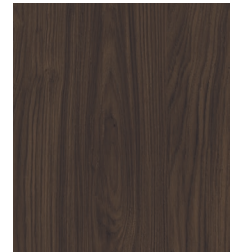
Marone Casella Oak