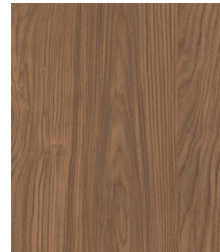
Brown Casella Oak